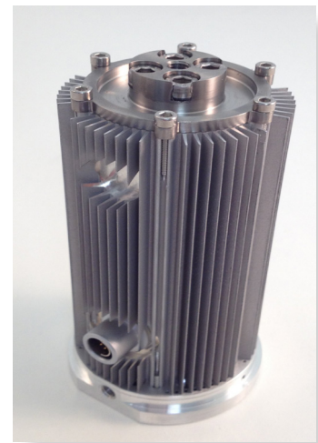
Encapsulated Pre-stressed Piezoelectric Actuator (PPA-E) Cedrat Technologies SA